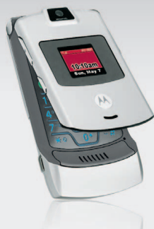
Motorola RAZR V3m > V CAST Music enabled > VZ Navigator™ capable