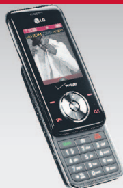
Chocolate™ by LG > ID songs and download on the fly > VZ Navigator ready with GPS