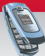
Samsung u340 > Camera > Text Messaging