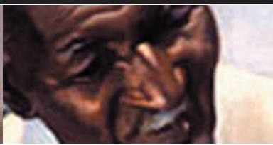
Celebrate African American Inventors - p. 8